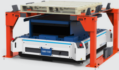
Freight Pallet AMR