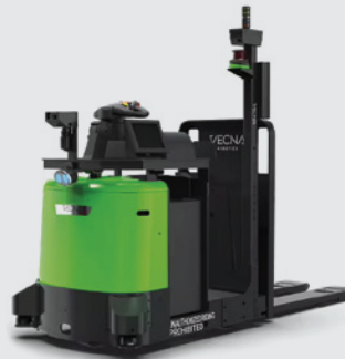
Autonomous Pallet Truck