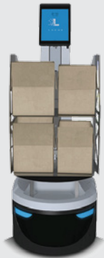
Assisted Picking Fulfillment AMR Origin