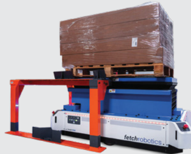
Freight Pallet AMR