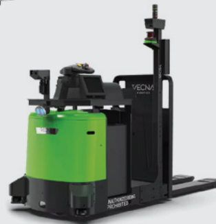
Autonomous Pallet Truck