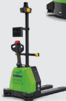
Cobot Pallet Jack