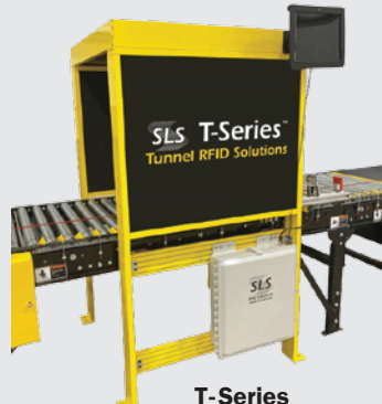
T-Series Tunnel Portal