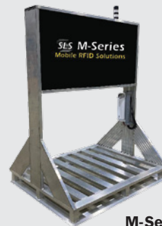
M-Series Mobile and Tabletop Readers