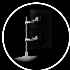
Dual Monitor Holder (V)