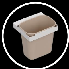
Waste Basket Holder