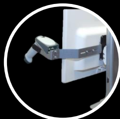
Monitor Scanner Holder