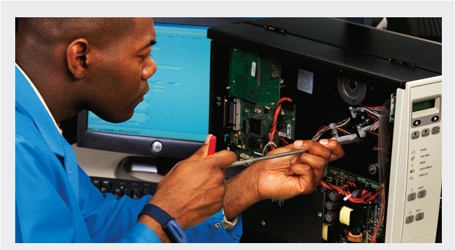
With Comprehensive Coverage we don't focus on how it happened, but on how to get you up and running as soon as possible.

Zebra understands that some of our customers may have special requirements that are not covered under any of our standardized service offerings. If there is a need that is not covered, please contact your Zebra account representative to discuss the customized need.