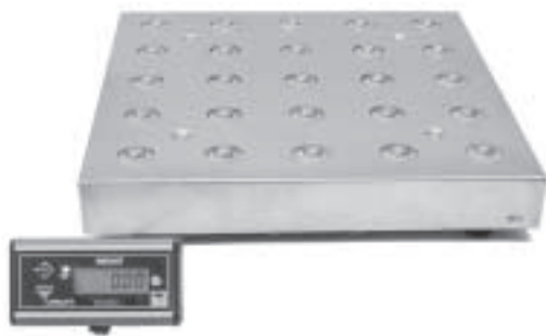
NCI Model 7885 shown with optional ball-top weight platter

The 7885 is simple to use, durable, accurate and reliable, and ideal for conveyor lines. The remote display can be placed in a convenient location to allow the user to view the weight, zero the scale, or send weight data. This NTEP approved scale fits into any operation as a stand-alone scale, interfaced to a shipping manifest software, or receiving station.