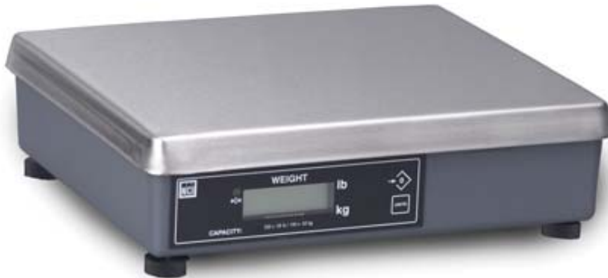
NCI Model 7821 shown with standard flat shroud