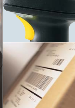
Big Business Tools. Small Business Attitude.

The Wasp Freedom Scanner gives you the wireless freedom to roam. With the Freedom Scanner, you can take your scanner to your inventory instead of your inventory to your scanner. The Wasp Freedom Scanner uses Bluetooth™ technology, which allows you to scan bar codes and transmit the data upwards of 160 feet feet depending on the environment. Scan bar codes from 1 to 12 inches with our aggressive CCD scan engine. The WWS800 "Freedom Scanner" complete kit comes with wireless scanner, Bluetooth™ radio/recharge base, CCD scan engine, cable for the base, and recharge power supply. Ideal for warehouse, factory floor, field service, and retail environments. The Wasp WWS800 Wireless Scanner supports Microsoft Windows, Microsoft NT, DOS and Macintosh applications.