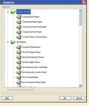
Access pre-built management reports