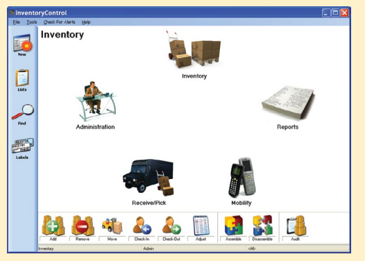
Manage your inventory