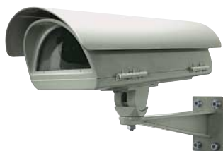
VERSO COMPACT + WBJ