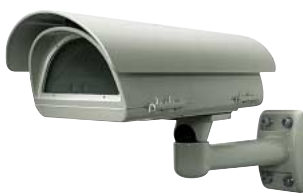
VERSO COMPACT + WBOV