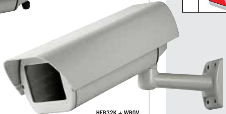
HEB32K + WB0V