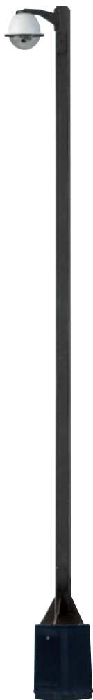
P1800 - Standard Pole with 20" Transformer Base