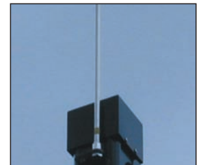
PV1 Lightning Rod