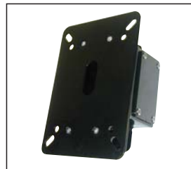
PV5 Junction Box