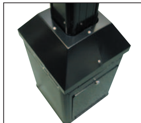
PV3 Base Cover