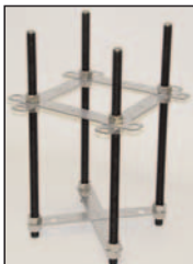
PV4 Anchor Jig

NOTE: PV4 anchor jig must be ordered separately