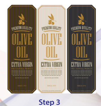
Flexible Labels Suitable for high-mix (or variations), low volume production