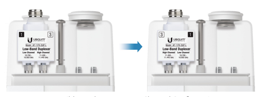
Reversible Duplexers For Easy Channel Configuration