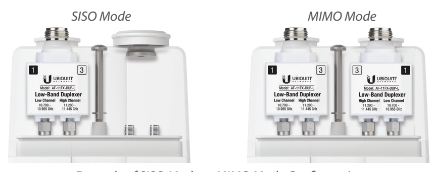
Example of SISO Mode vs MIMO Mode Configuration