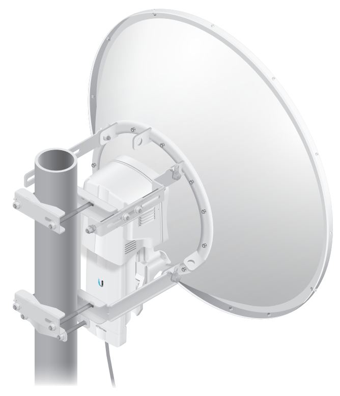
Back View of AF-11G35 With AF-11FX Radio