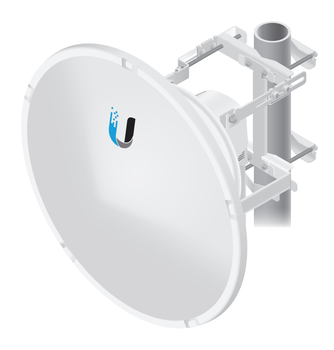
Front View of AF-11G35 With Radome