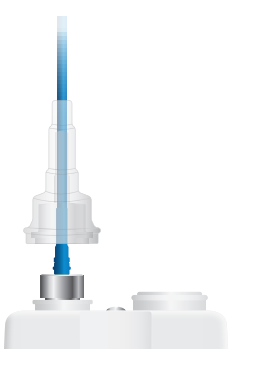
N-Connector with Boot Retracted