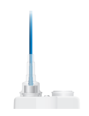
N-Connector with Boot In Place