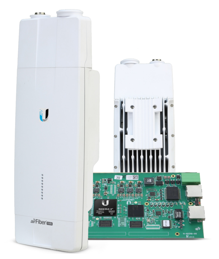
AF-11FX INVICTUS 2 Custom Silicon Design

Specially designed silicone boots provide a weatherproof barrier against dust and moisture.