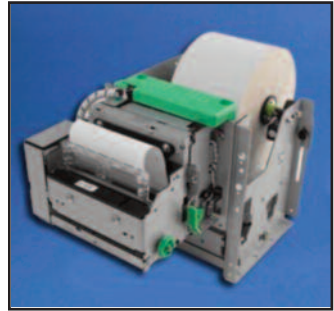
Looping Presenter with Document Presenter