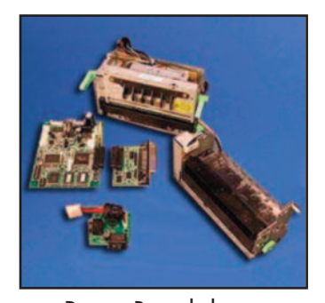
Parts Breakdown Available