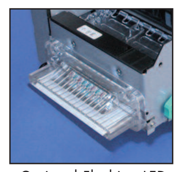
Optional Flashing LED Bezel