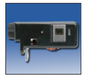
Optional Near End Sensor