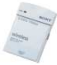
SNCA-CFW1 Wireless Card