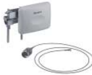
SNCA-AN1 Wireless LAN Antenna (for use with SNCA-CFW1 Wireless Card)