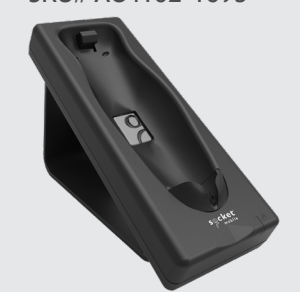
Perfect for wall mounting