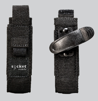
Safe and accessible placement