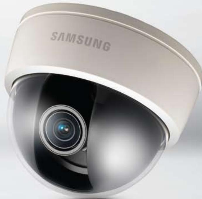
VGA Network Varifocal Dome Camera