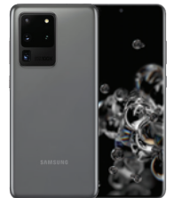
Galaxy S20 Ultra

Contact Us: samsung.com/unlockedforbusiness