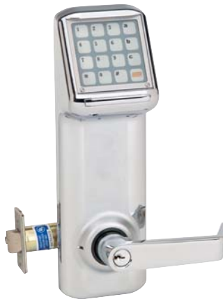
Plated Architectural Finishes Chrome, Brass, Oil Rubbed Bronze