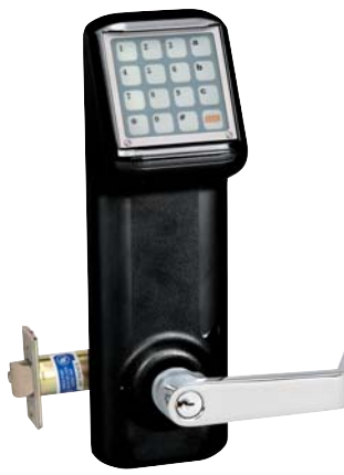
Black Economy Finish