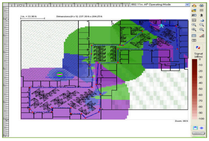
802.11n coverage maps