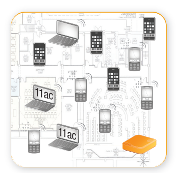
Ultra High User Density