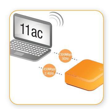
Blinding Fast 3-Stream 802.11ac