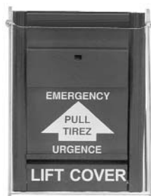
904 3-1/2" x 4-3/4"