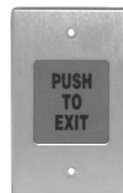
917 4-1/2"H x 2-3/4"W