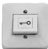
909S/909F 2-3/8" x 2-3/8"