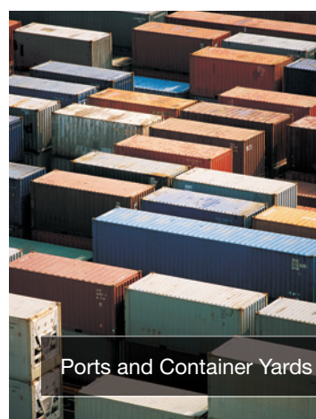
Ports and Container Yards