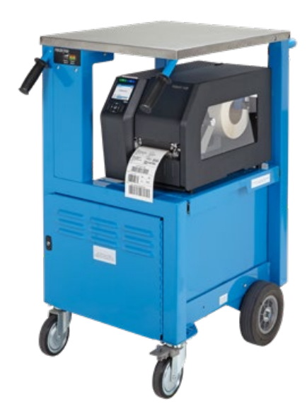
Powered Mobile PrintCart