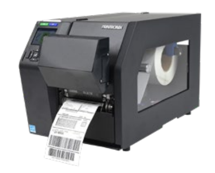
Barcode Verifier (T8000 ODV-2D)