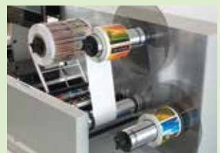
Rewinding to finished rolls