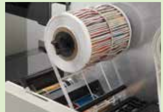
Waste matrix removal