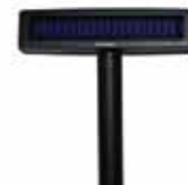
Optional Pole display