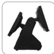
Dual Side View