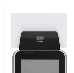
Add-on MSR module