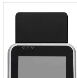
Add-on RFID module