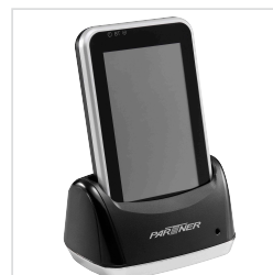
Cradle with spare battery charging slot