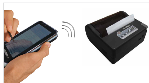
Print orders directly to MP-300 mobile printer via Bluetooth