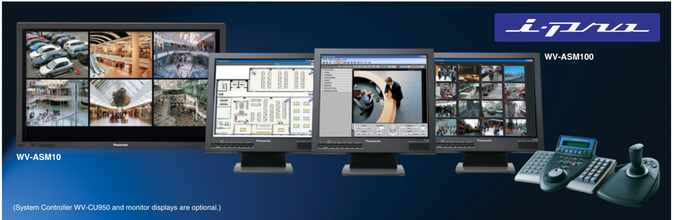
(System Controller WV-CU950 and monitor displays are optional.)