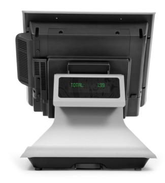
4x20 VFD Display