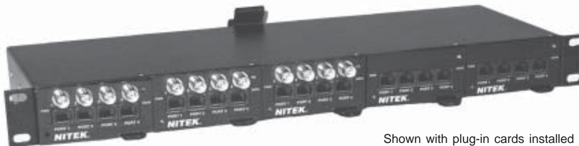
Shown with plug-in cards installed (order cards separately)