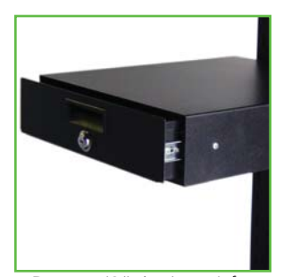
Drawer (3" / 76 mm) for NB, PC & RC Series