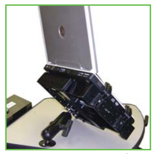
Laptop/tablet holder for NB, PC & RC Series