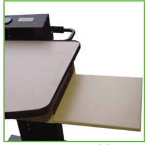
Slide-out shelf for NB & RC Series