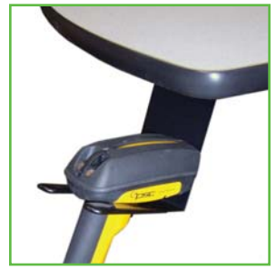
Scanner holder for NB, PC & RC Series

© Newcastle Systems, Inc. / USA Rev. 18 Content is subject to change without notification