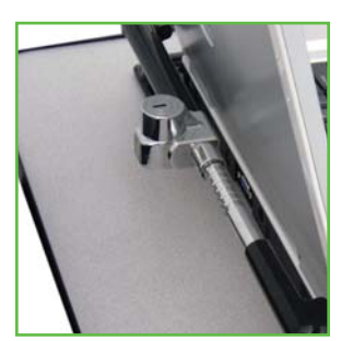
Laptop security bracket for NB & RC Series