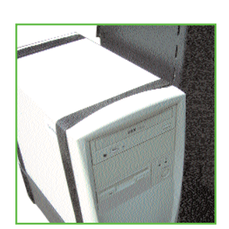
CPU holder for NB & PC Series