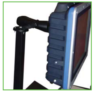
LCD support for NB & PC Series