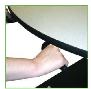
Add-on push handles for NB Series