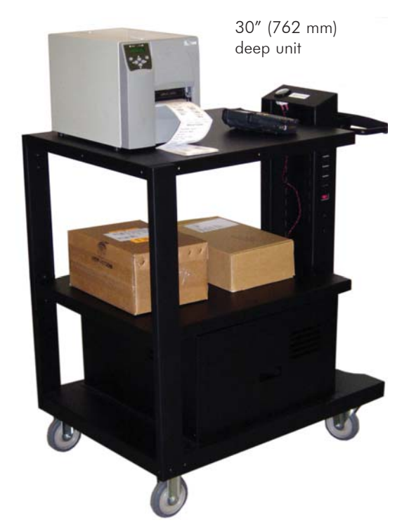
PC Series Workstation with optional middle shelf

A number of optional accessories are available and can be easily integrated in seconds for a highly verstile workstation. (See accessories on page 8).