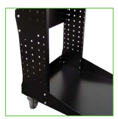
Full storage on lower shelf w/non powered version