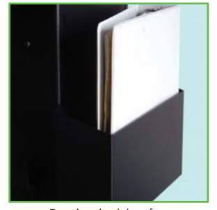
Binder holder for NB & PC Series