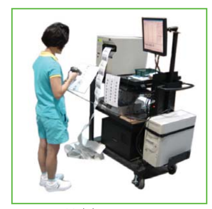
Mobile print station