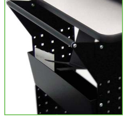
Standard storage compartment

Weight: Powered: 115+(52 kg), Non-Powered: 70 lbs (32 kg)