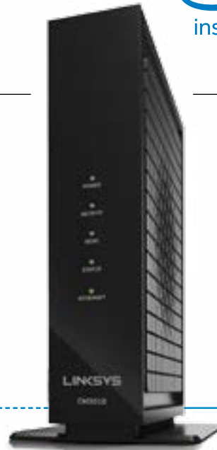
MODEM Converts data to Ethernet