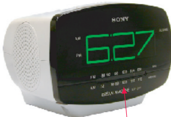
Pinhole Camera Hidden Behind Clock Radio Tuner

Connect the Clock Radio power supply leads into an electrical outlet and connect the video lead into monitor or recorder. This will complete the installation process and you are ready to monitor or record the images captured by unit.