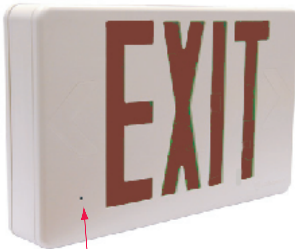
Pinhole Camera Hidden Within Exit Sign

Connect the Exit Sign power supply leads into an electrical outlet and connect the video lead into monitor or recorder. This will complete the installation process and you are ready to monitor or record the images captured by unit.