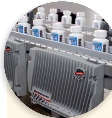
Speedway reader tracking a pharmaceutical bottle line.

Impinj's breakthrough approach to the Speedway reader's antenna ports makes UHF near-field operations possible. Enabled by our patented INR™ technology, no other reader has it. In short, it means the Speedway reader is the only reader that performs equally well in conventional far-field (long-range operations in warehouses, distribution centers, etc.) and in near-field applications (short-range operations on small, individual items). A whole host of optimized reader antennas designed specifically for the Speedway reader completes the picture. The Speedway reader has in fact changed the game in RFID, extending the power of the UHF Gen 2 standard to the item level.