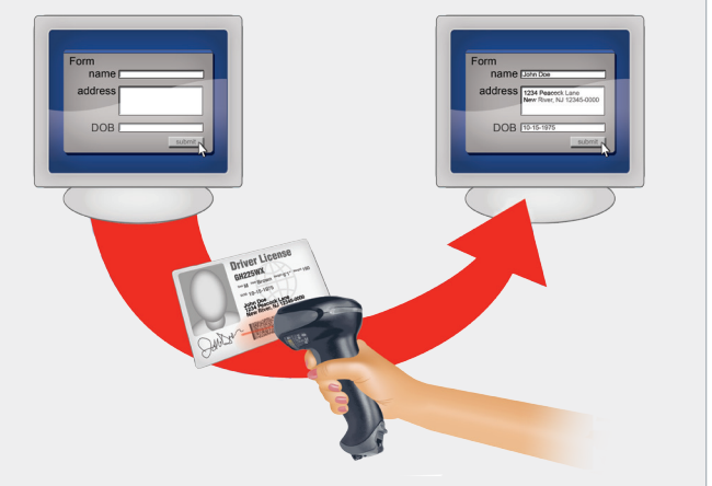
Automatically populate electronic forms in a single scan