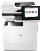
HP LaserJet Enterprise MFP M633fh