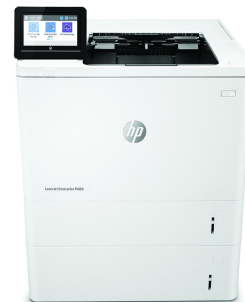
HP LaserJet Enterprise M609x