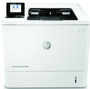
HP LaserJet Enterprise M609dn

This HP LaserJet Printer with JetIntelligence combines exceptional performance and energy efficiency with professional-quality documents right when you need them – all while protecting your network from attacks with the industry's deepest security 1