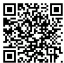
UX10 3D Demo