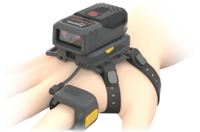
GS R5520 Ruglove