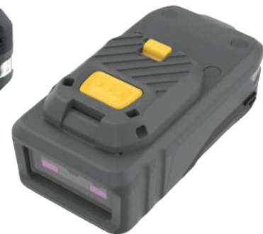
GS R5520 Thumbbutton