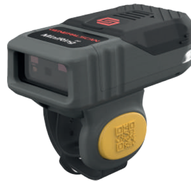
GS R5520 Ring

Using the NFC makes the Bluetooth connection more convenient and faster. User can simply tap the scanner with any NFC-enabled devices. No need to open the Bluetooth settings to identify and select the device.