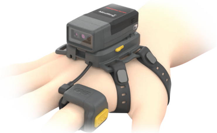
GS R1522 Ruglove