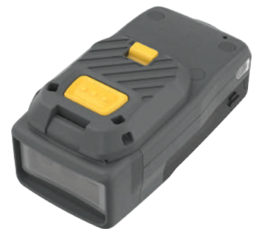
GS R1522 Thumbbutton