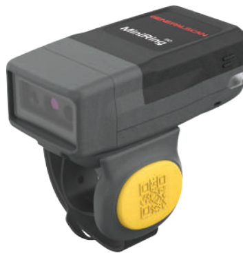
GS R1522 Ring

Using the NFC makes the Bluetooth connection more convenient and faster. User can simply tap the scanner with any NFC-enabled devices. No need to open the Bluetooth settings to identify and select the device.