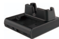
Battery Charging Base