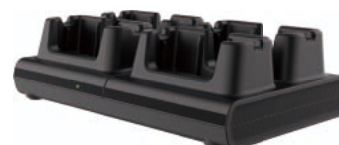
Battery Charging Base-4 slots