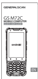
Quick User Guide