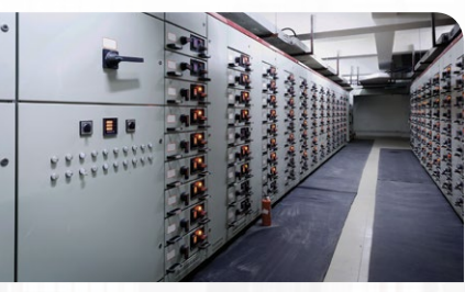
Constantly Monitor Critical Equipment

Combining thermal and visual cameras in a small, affordable package, the AX8 measures only 54 \times 25 \times 95 mm, making it easy to install in space-constrained areas for uninterrupted condition monitoring of critical electrical and mechanical equipment.