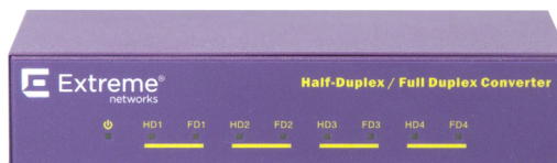
Half-Duplex / Full-Duplex — Back