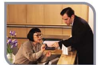
Bank and Office