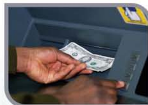
Cash Vault Operation