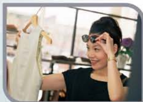
Store and Mall