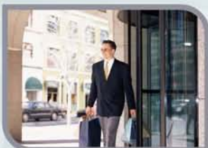
Building and Entrance