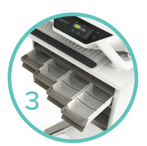
Coming soon: CareFit Pro with multiple drawer configurations!