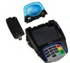
MODULAR CONNECTIVITY (Contactless Module)