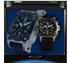
Large, 5.7" Color Screen Perfect for Advertising Campaigns