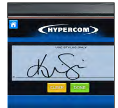
Electronic Signature Capture