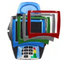
CUSTOMIZABLE BEZEL (To Match Your Marketing Brand)