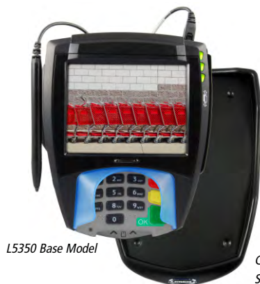
L5350 Base Model