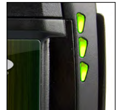
Standard Encrypting Magnetic Stripe Reader

Hypercom's commitment to security does not stop with the meeting of payment security compliance requirements. The L5350 comes standard with an encrypting magnetic stripe reader (MSR), ensuring the card data is automatically encrypted as cards are swiped, thus protecting sensitive card information during the transaction process. Each device has a full X509 public key infrastructure, allowing retailers to protect their applications from hacking and preventing all malware attacks.