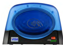
Optional Modular Contactless Reader